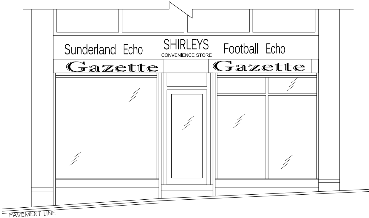
WHITBURN-2052343 EXISTING ELEVATION @ 1:50