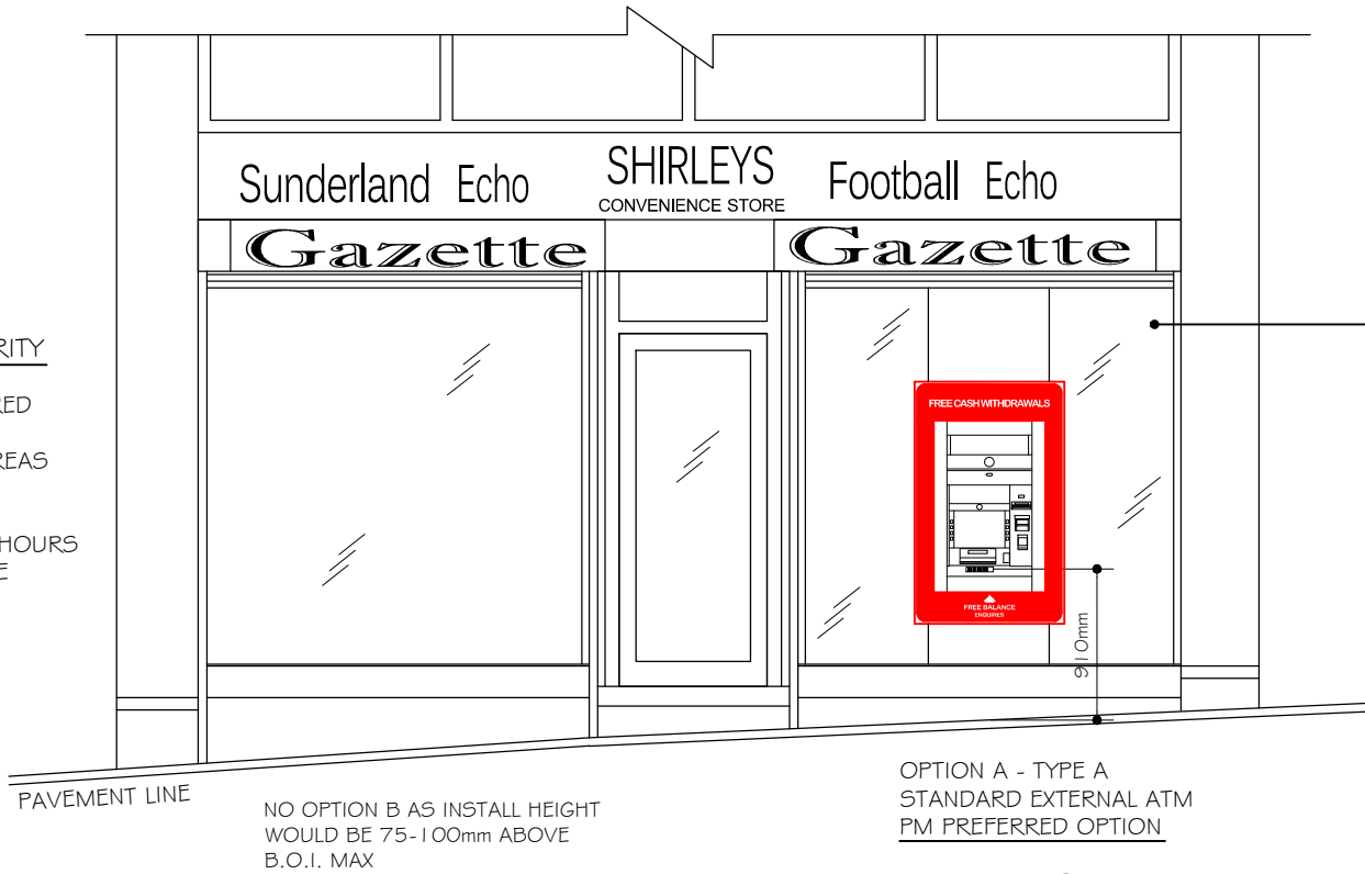
WHITBURN-2052343 EXISTING ELEVATION @ 1:50

TYPE A - STANDARD EXTERNAL ATM REF: PO - J1 900mm X 1456mm STANDARD WINCOR 8050 WITH ILLUMINATED SIGNAGE SURROUND